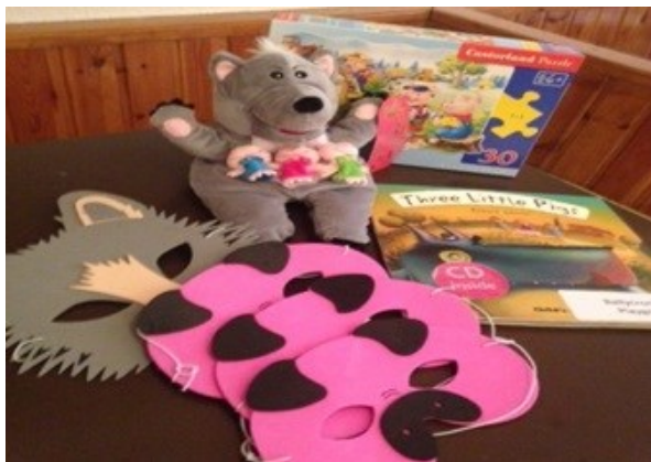
Ballycrogan Playgroup, Bangor Big Bedtime Read