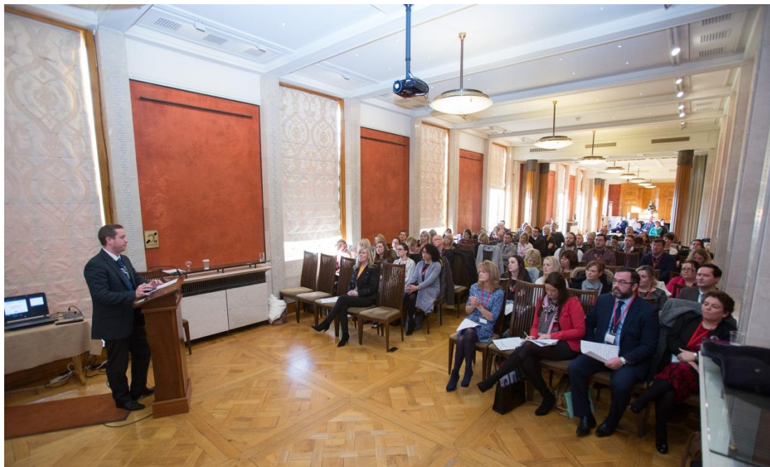
The Edges Service address at the Long Gallery, Stormont