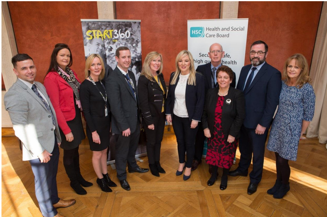
Department of Health Minister, Michelle O’Neill at the EDGES Service Showcase event at Stormont, November 2016

On 24 November the Edges Service was introduced at the Long Gallery, Stormont by Health Minister Michelle O’Neil and Health and Social Care colleagues.