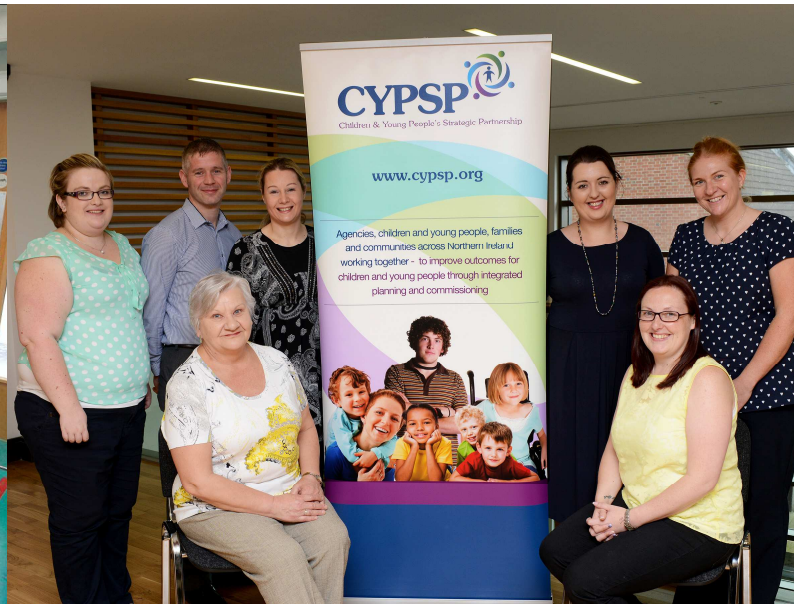
Dungannon Stakeholder event- June 2014

There are approximately 10,787 0-17 year olds in Dungannon