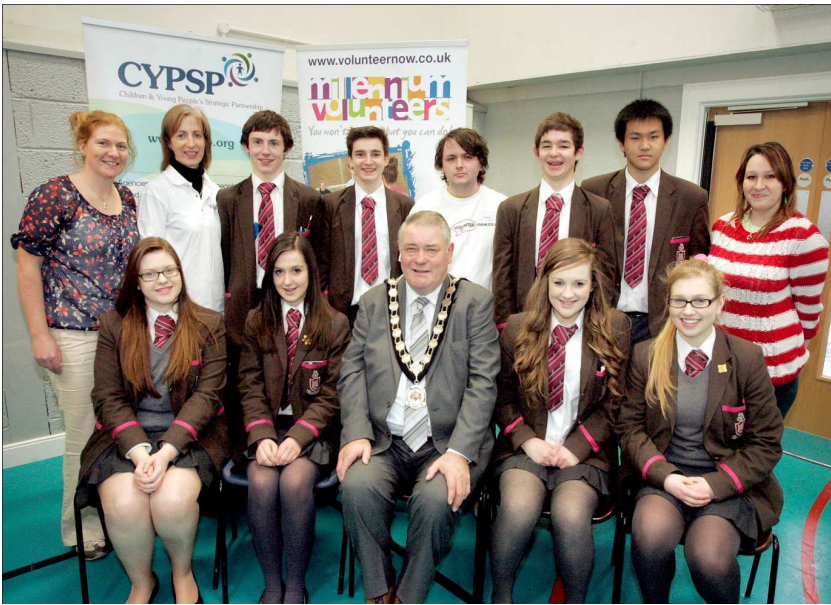
Volunteer Fair- March 2013