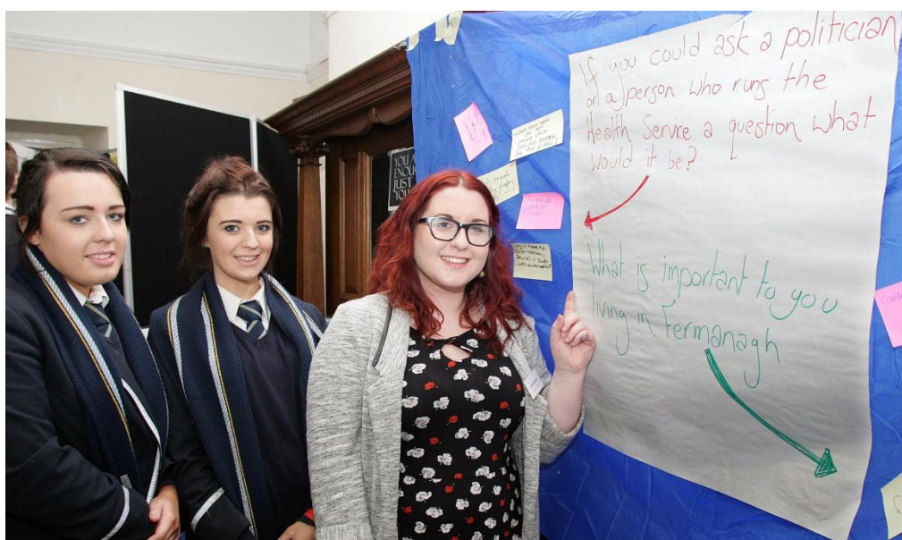
Young people from local schools sharing their views on what matters to them at the Fermanagh Stakeholder event

The event, organised by the Children and Young People's Strategic Partnership (CYPSP) and the Policing and Community Safety Partnership (PCSP), brought local young people together with representatives from statutory, voluntary and community organisations to discuss the services currently available to support children and young people and how these can be improved in future.