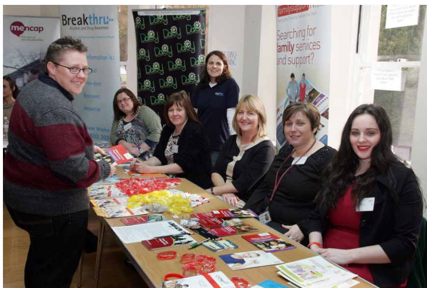
Organisations at the CYPSP Information Session for children and young people at the Fermanagh Stakeholder event